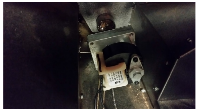
Step 7 – Try to back auger shaft off of the bracket by twisting counter clockwise