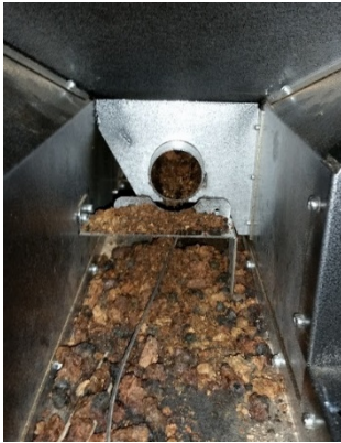
Step 9 – Vacuum remaining pellet material after removing auger