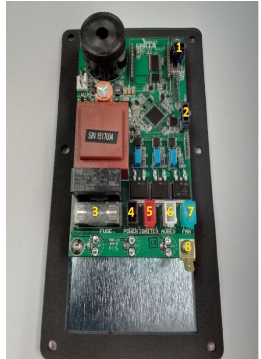
Pellet Boss controller