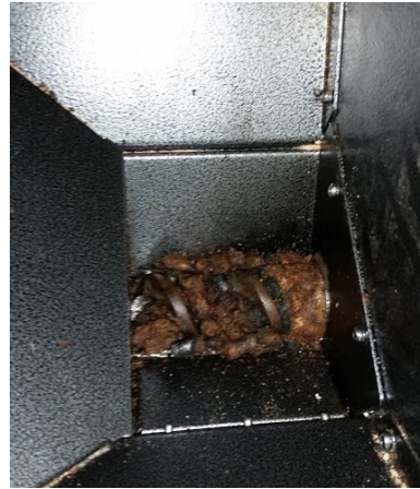
Step 6 – Remove all pellets around the auger on the inside of the hopper