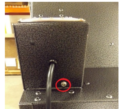
Step 4 – Two Star Grills ONLY

*TWO STAR GRILLS ONLY: Remove the screw holding the fan bracket in place (found near the power cord) before removing the fan bracket.)