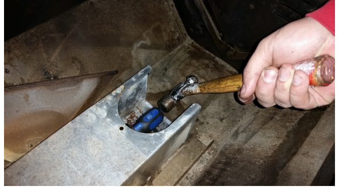
Step 8 – Insert screwdriver into auger tube and use a hammer or mallet to tap the end of the screwdriver

Once the auger has been removed, vacuum out the auger tube and any remaining pellet material inside the auger tube and grill. Remove all pellet material stuck to the auger shaft.