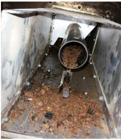
Step 6 – Looking into the auger tube from the firepot side