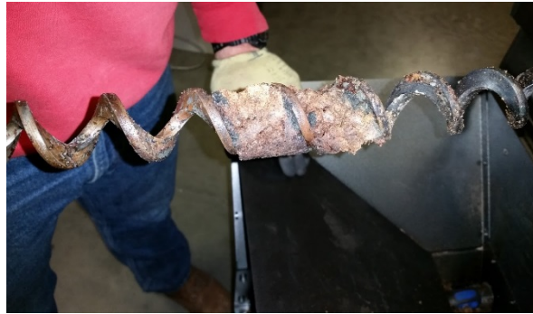
Step 9 – Clean off any pellet material left on the auger shaft before reassembling.